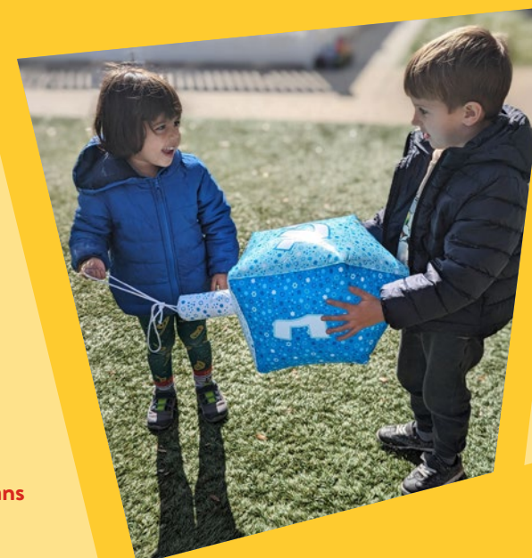
◀ Jewish Community Center

Louisiana Community Mikvah Gold-level Donation