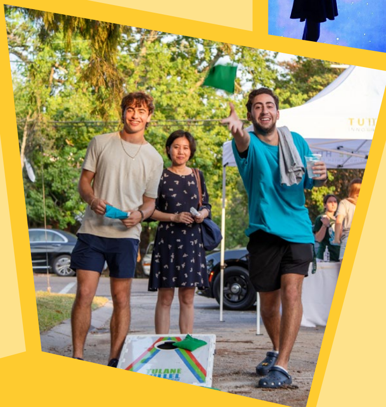
◀ Tulane Hillel