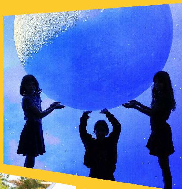
Jewish Community Day School ▶

These grants are only possible because our supporters understand that, by entrusting their charitable funds with JEF, they are investing in programs that directly support our community. Grants from the General Fund and Board Designated Funds help to address the most pressing needs and promising opportunities that benefit the entire Greater New Orleans Jewish community, including JFGNO's constituent agencies: Jewish Community Center, Jewish Family Service, Jewish Community Day School, and Tulane Hillel.