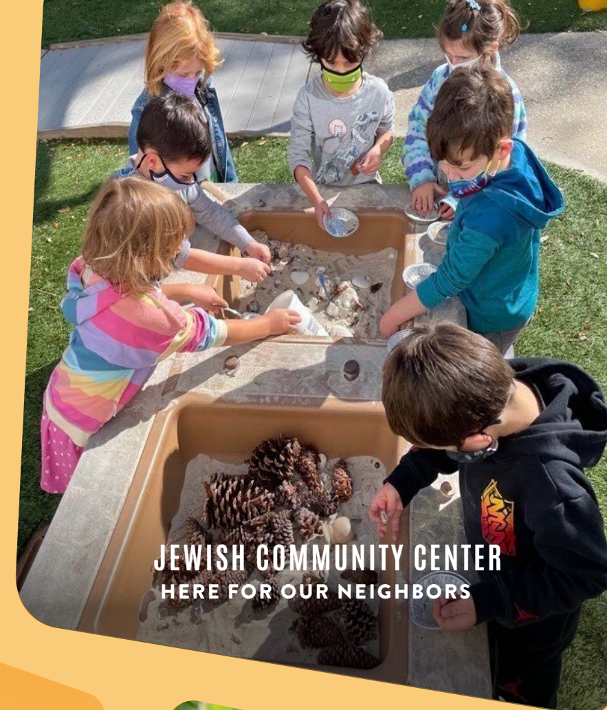
JEWISH COMMUNITY CENTER HERE FOR OUR NEIGHBORS