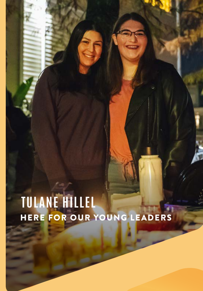
TULANE HILLEL HERE FOR OUR YOUNG LEADERS