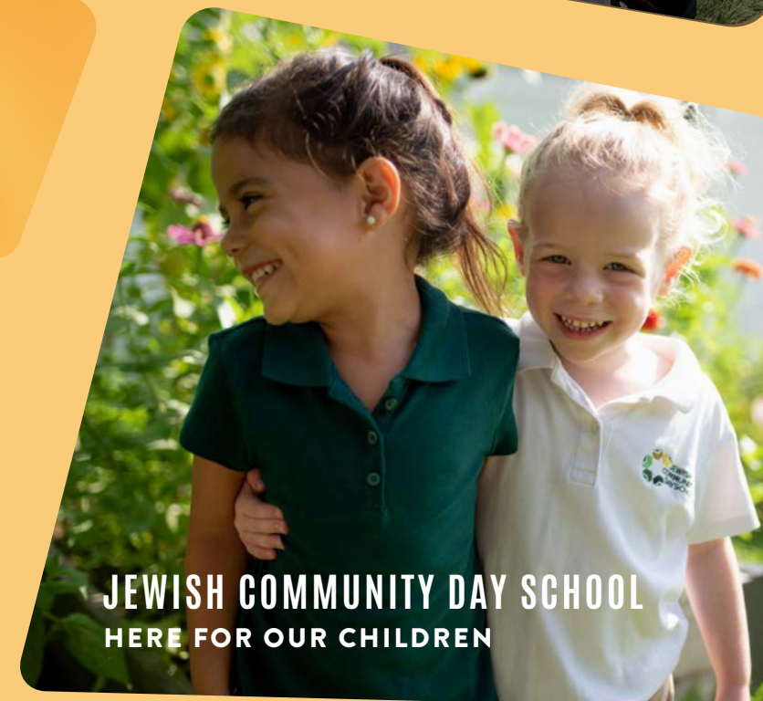
JEWISH COMMUNITY DAY SCHOOL HERE FOR OUR CHILDREN