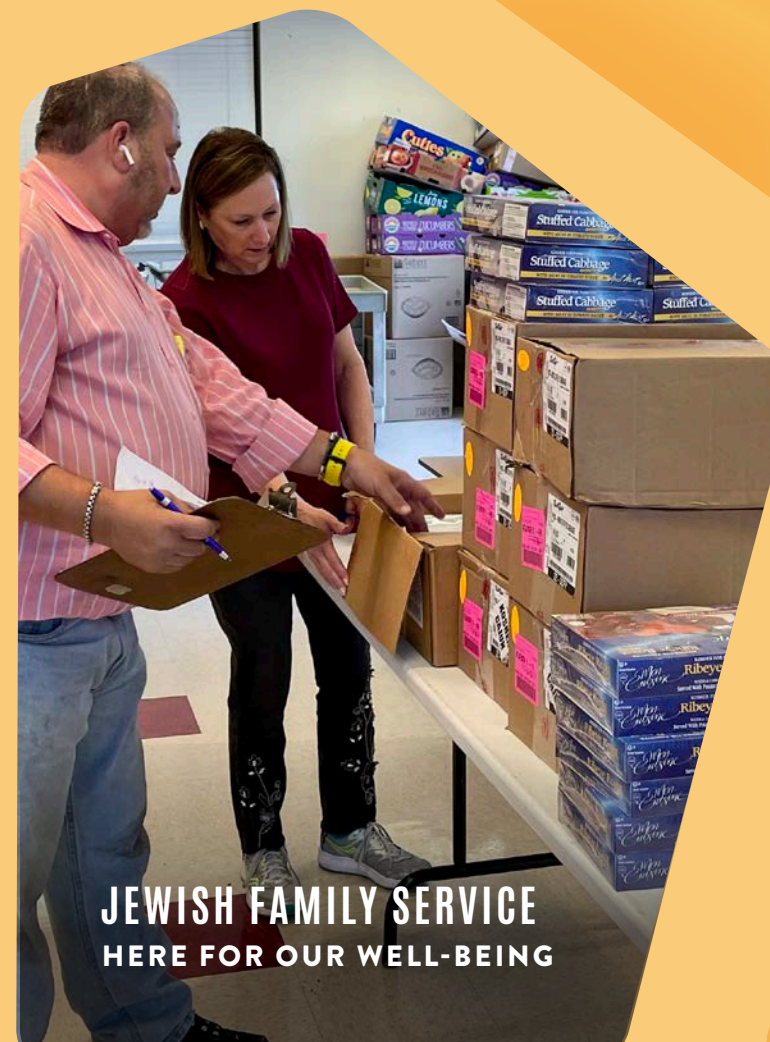
JEWISH FAMILY SERVICE HERE FOR OUR WELL-BEING