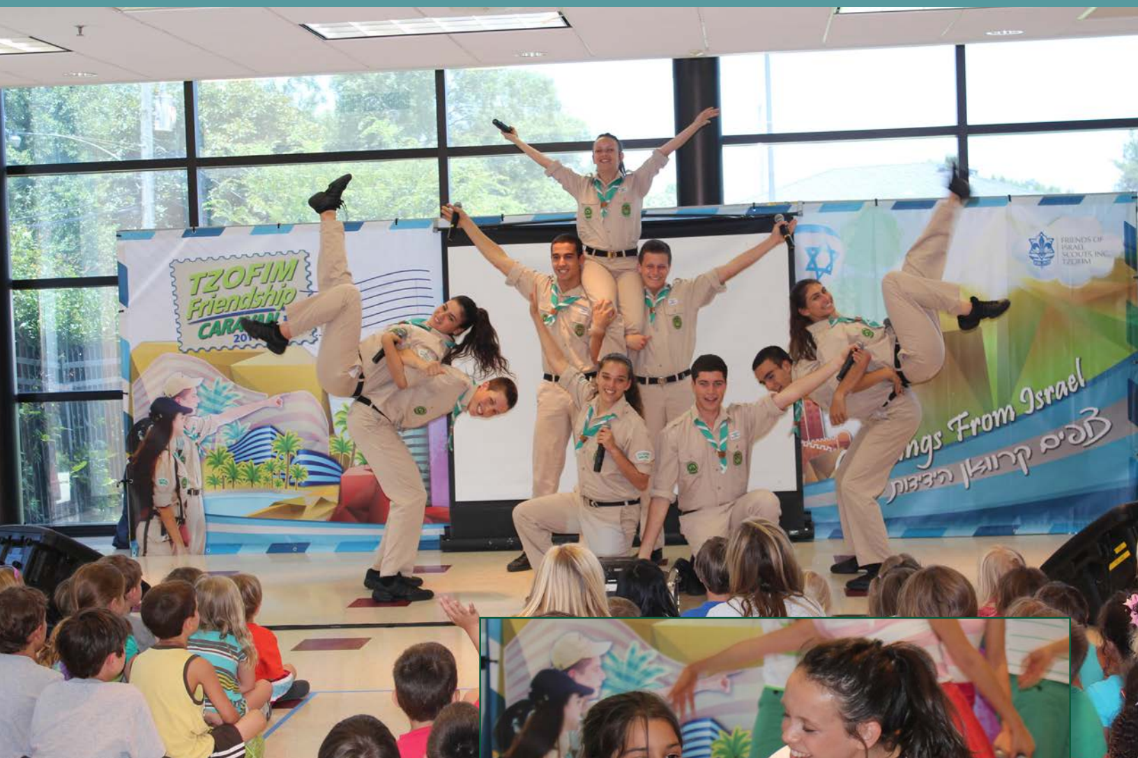
Israel Tzofim Scouts entertain and teach JCC campers through a grant from JEF.