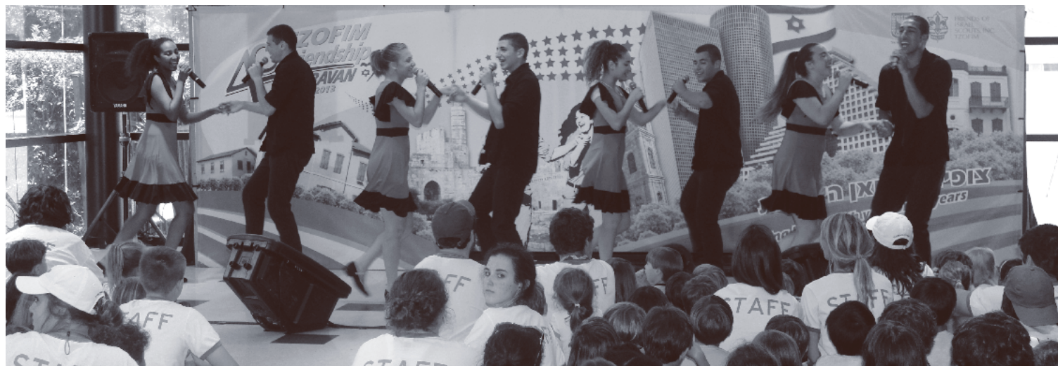
Israeli Tzofim Scouts dazzle Metairie JCC campers with song and dance.